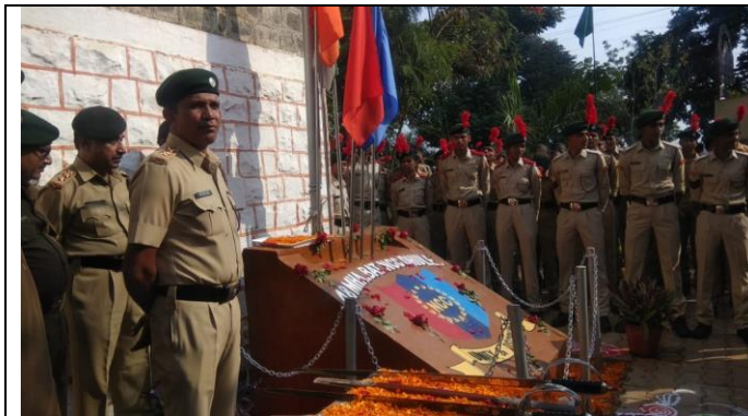
Celebration of NCC Day

The number of cadets participated (M.S.G.College Student=75).