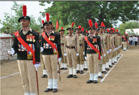
Cadets doing March Pass