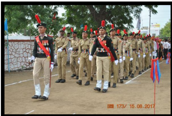
Cadets Doing March Pass