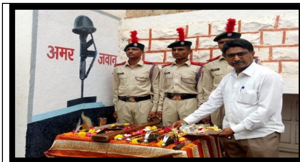
Cadets and ANO paying tribute to martyr soldiers

Activities such as the Voluntary Oratorical competition were held to instill a sense of patriotism in the cadets while also polishing their creativity and imagination. The number of cadets participated=70